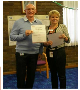
Calvary Health Care (Sydney) TAE40110 - Certificate IV in Training & Assessment