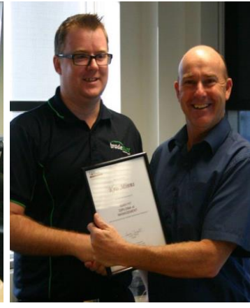
Forbes Chatham Insurance Pty. Ltd. (Sunshine Coast) BSB40610 Certificate IV in Business Sales