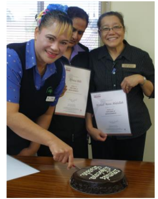
Bankstown Aged Care (Sydney) BSB51107 - Diploma of Management