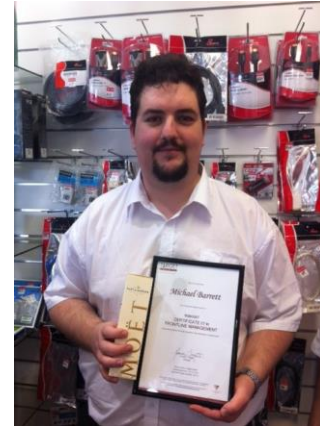
Mooloolaba Computers (Sunshine Coast) BSB40807 - Certificate IV in Frontline Management BSB51107 - Diploma of Management