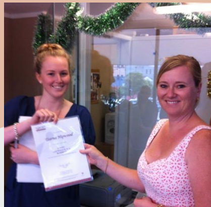
Industry Pathways (Gold Coast) BSB40207 - Certificate IV in Business BSB40507 - Certificate IV in Business Administration